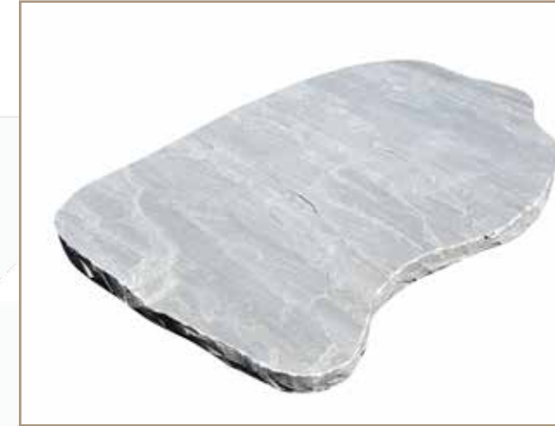
KANDLA GREY SAND STONE