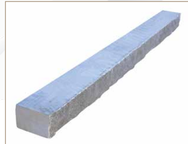
C.BLACK LIME STONE