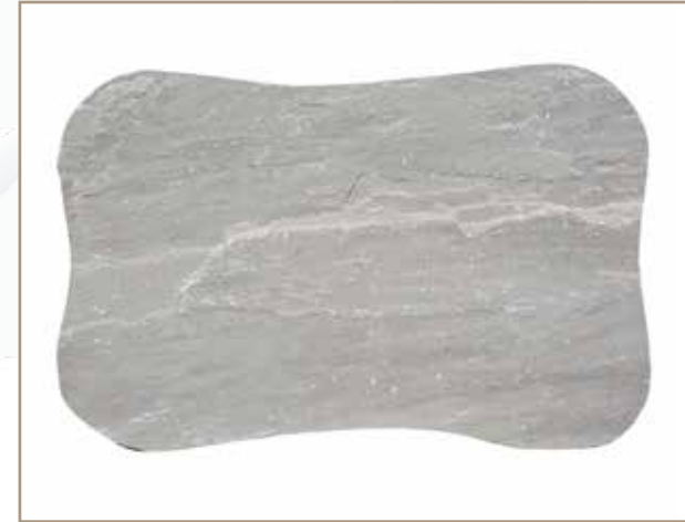
KANDLA GREY SAND STONE