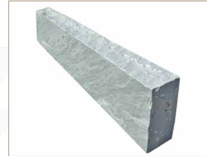
KANDLA GREY SAND STONE