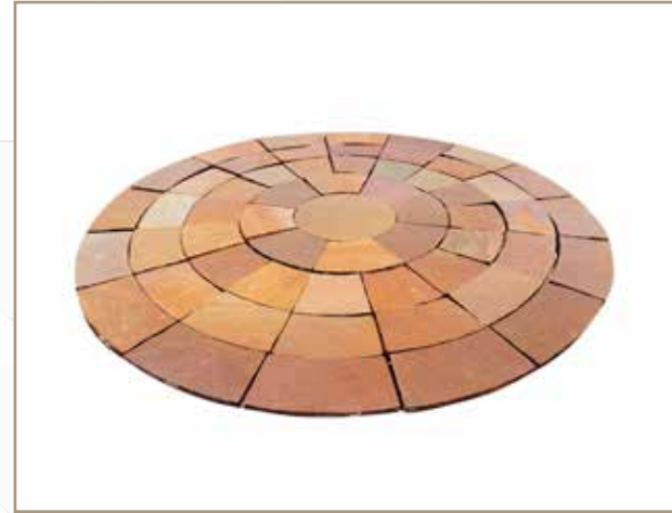
AUTUMN BROWN SAND STONE