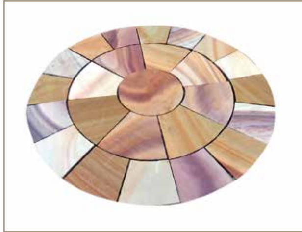
RAJVENA SAND STONE