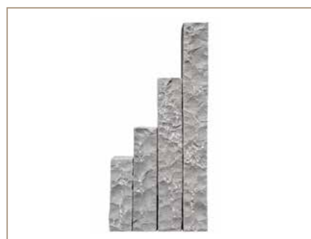
KANDLA GREY SAND STONE