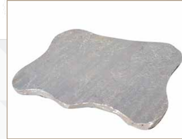
KANDLA GREY SAND STONE