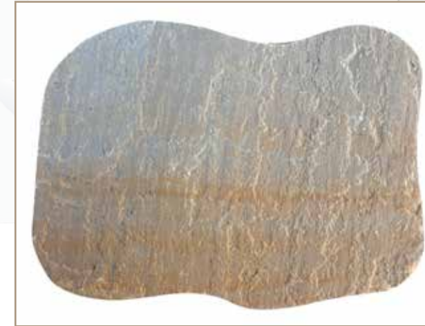
DYB SAND STONE