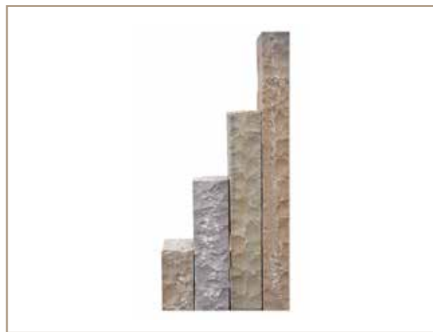
MULTI SAND STONE