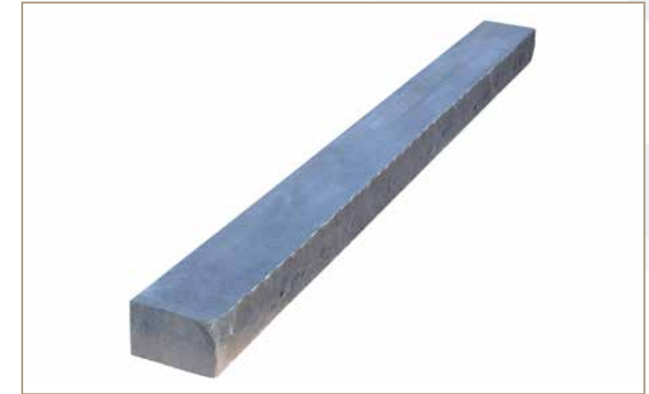
SAGAR BLACK SAND STONE