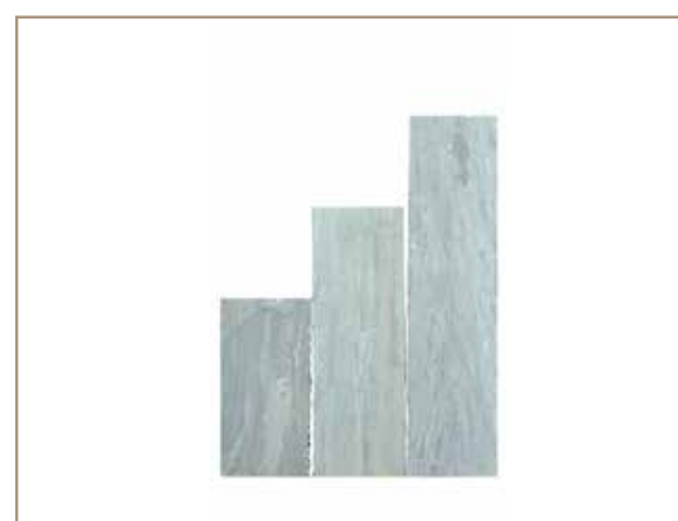
KANDLA GREY SAND STONE