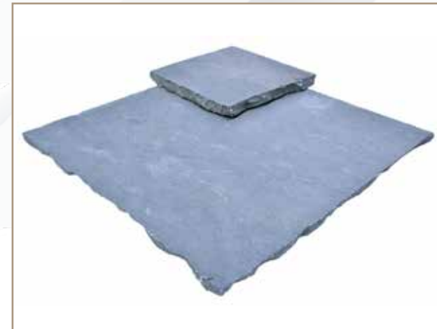
KANDLA GREY SAND STONE