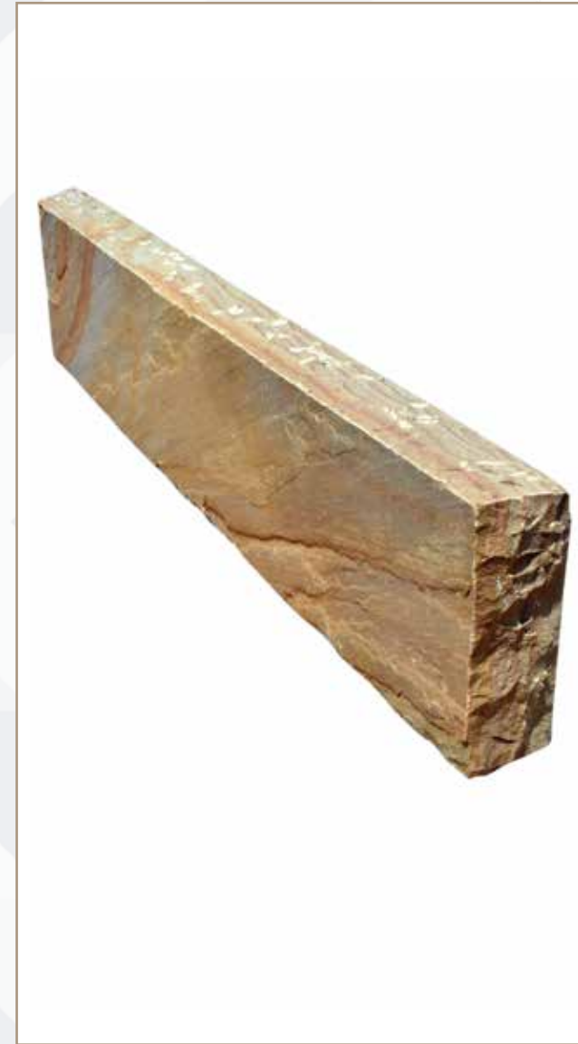
DYB SAND STONE