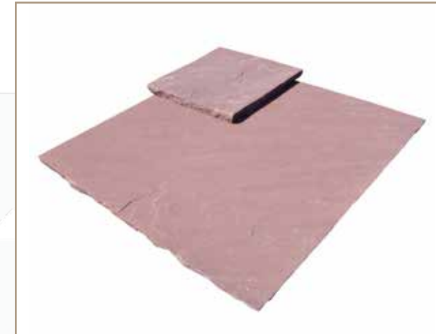
MANDANA RED SAND STONE