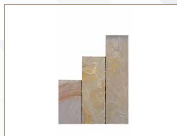
DYB SAND STONE