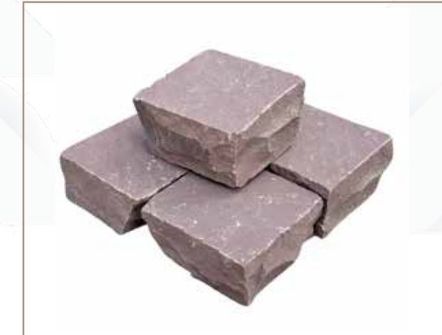
RED SAND STONE