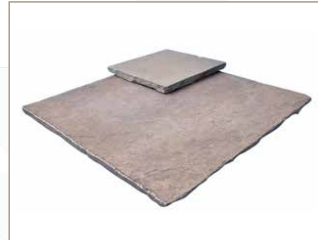
KOTA BROWN LIME STONE