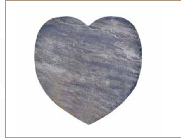
SAGAR BLACK SAND STONE