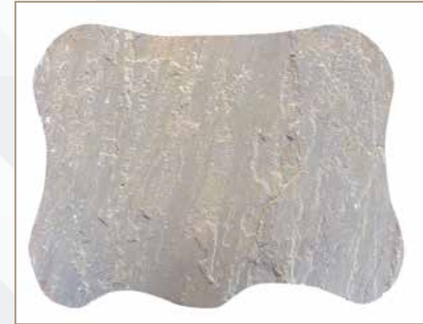
KANDLA GREY SAND STONE