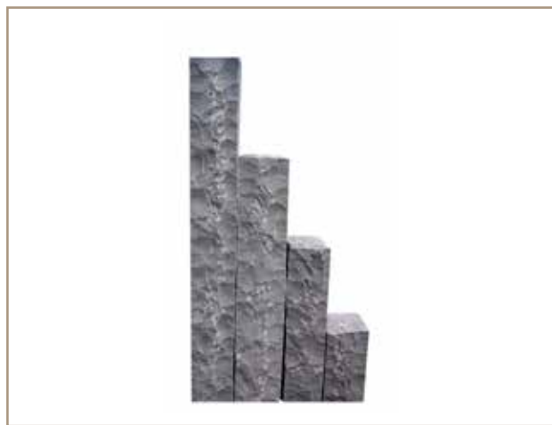
KANDLA GREY SAND STONE