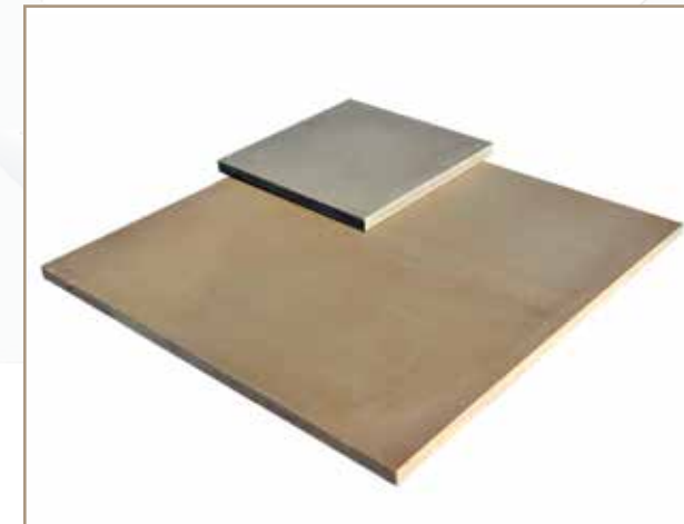
AUTUM BROWN HONED