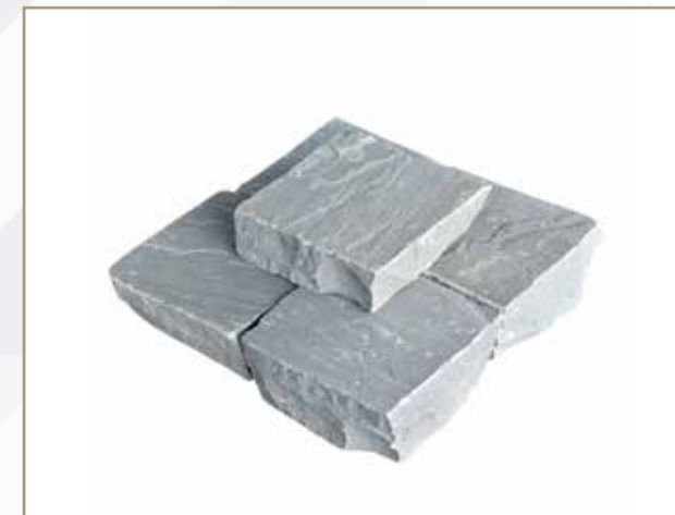
KANDLA GREY SAND STONE