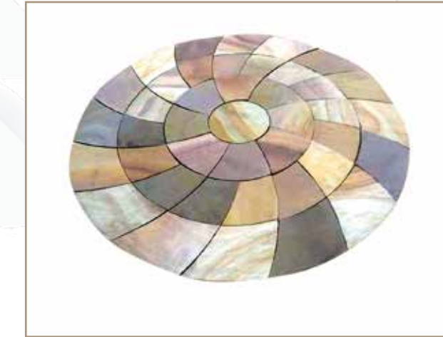
MULTI COLOR SAND STONE