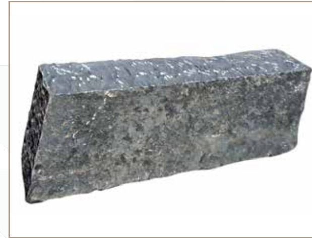
C.BLACK LIME STONE