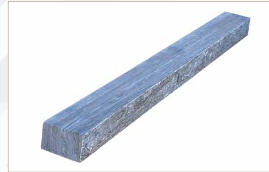
ROYAL BLACK QUARTZITE