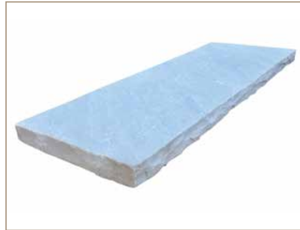
KANDLA GREY SAND STONE