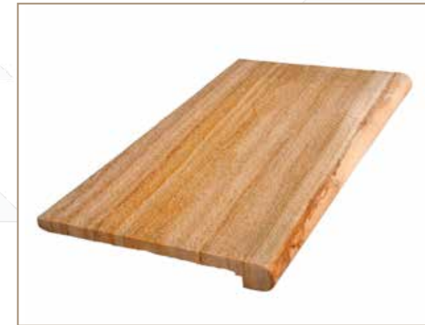
TEAKWOOD SAND STONE