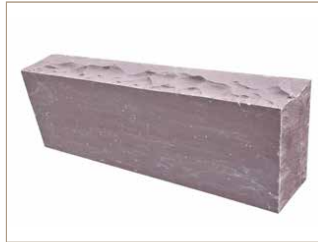
RED SAND STONE