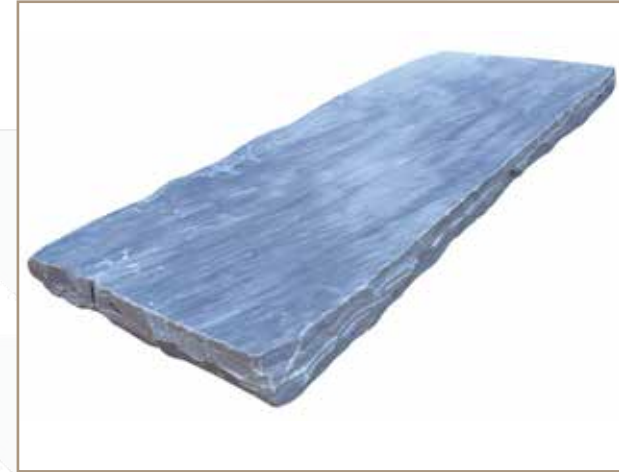
SAGAR BLACK SAND STONE