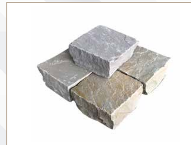
MULTI SAND STONE