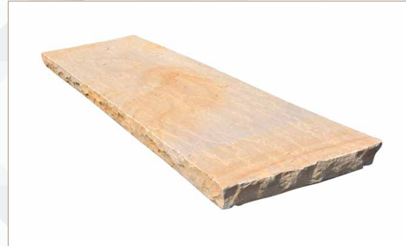
DYB SAND STONE