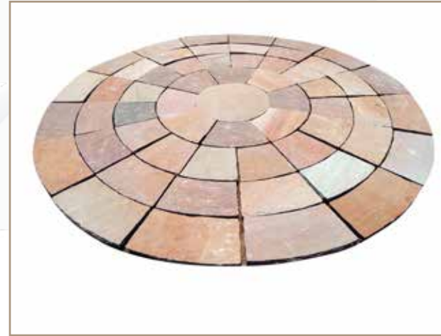
RAJ BLEND SAND STONE