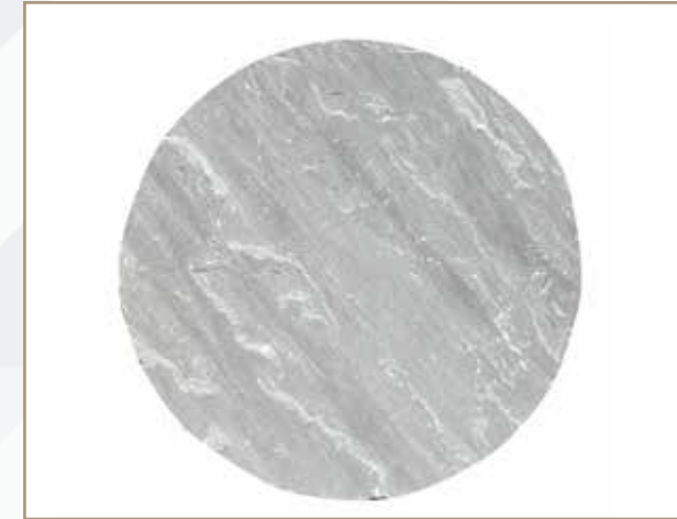
K. GREY FULL MOON SAND STONE