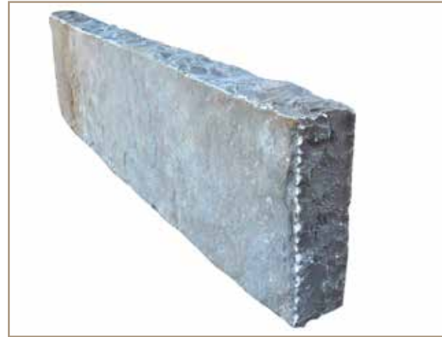
KOTA BROWN LIME STONE