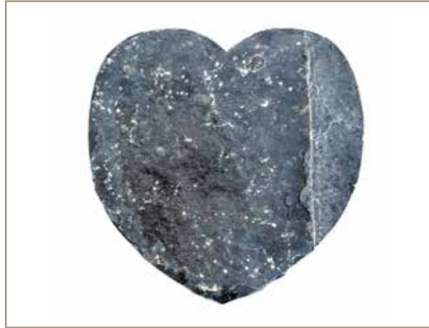
C.BLACK LIME STONE