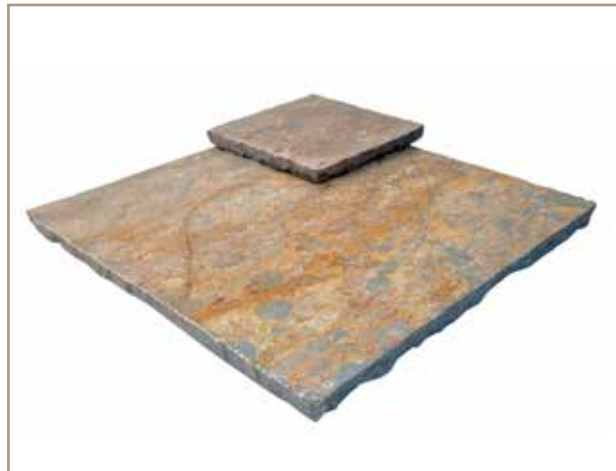
KOTA HONEY LIME STONE