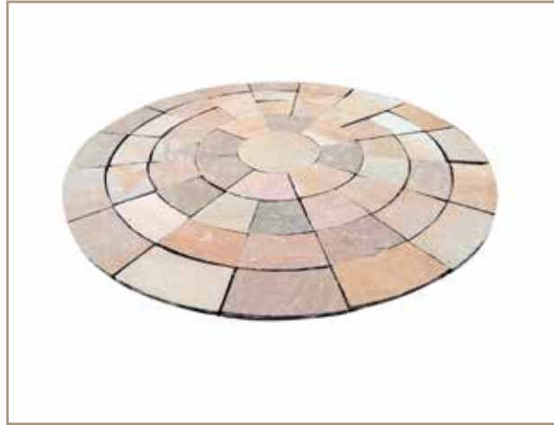
RAJ GREEN SAND STONE