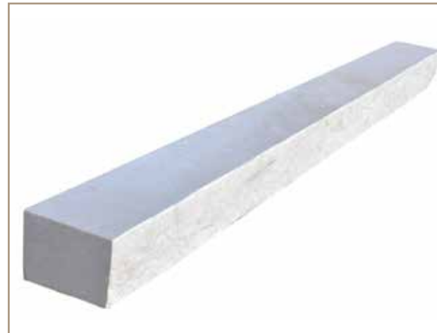
MINT SAND STONE