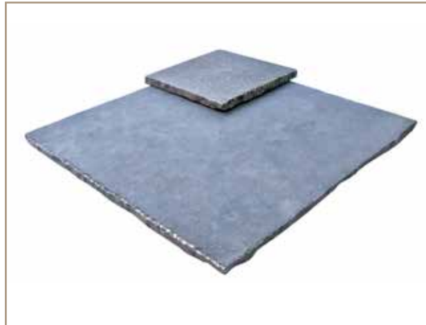
KOTA BLUE LIME STONE