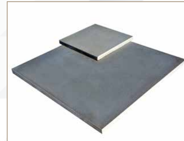
KANDLA GREY HONED