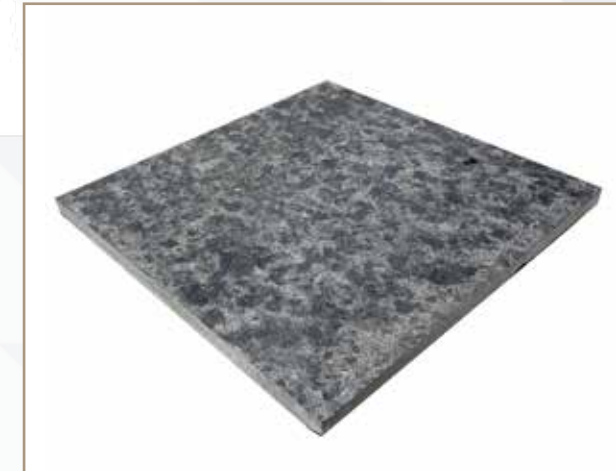
BLACK BASALT FLUMED