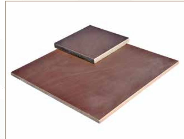
MANDANA RED HONED